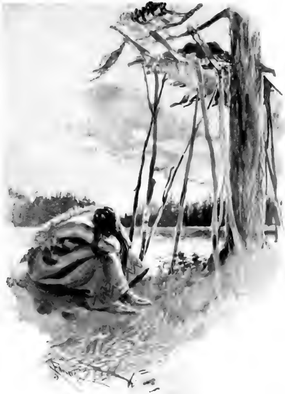
"AN INDIAN GIRL WAS SITTING WHERE HER LOVER, SLAIN IN BATTLE, SLEPT."—Page 44.